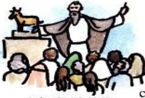
Joshua 24:1-2, 15-18

In today's first reading, Joshua told the people that they had to choose between the false gods and the true God. Joshua and the people chose to worship the true God.